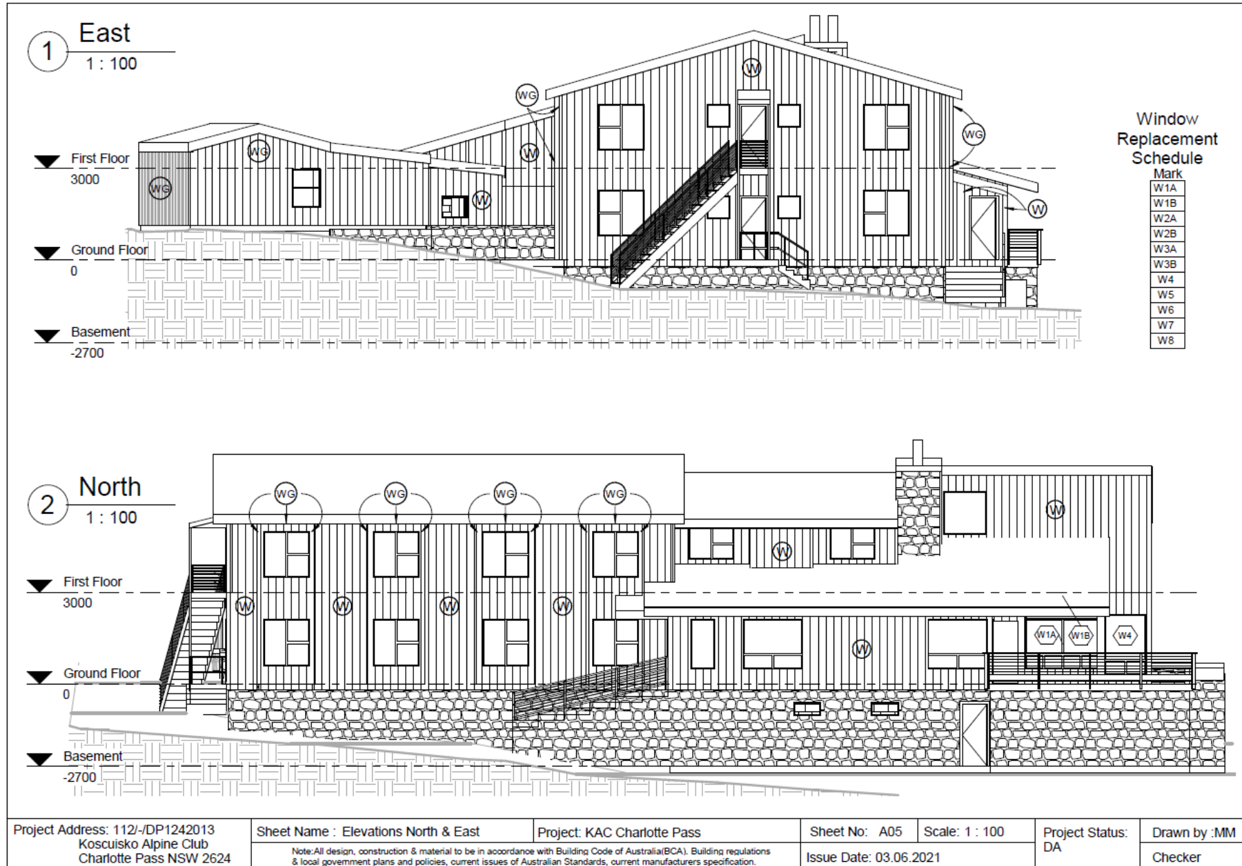
Figure 1: East and north elevations showing cladding replacement (W and WG) and window replacements